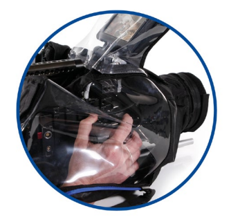
Spacious interior to hold the camera including rig, cage and/or top handle.