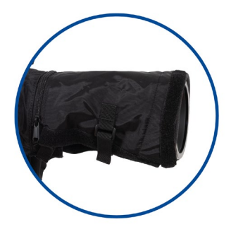
The option to expand with longer lenses thanks to the camRade lensC support.