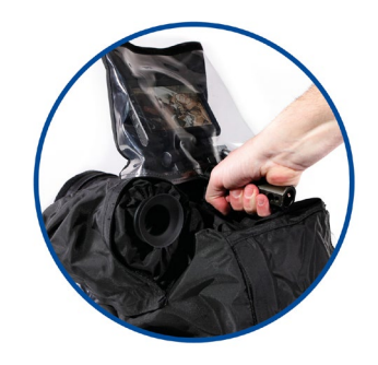
Attach or detach the cover in seconds, whether used handheld or on a support plate.