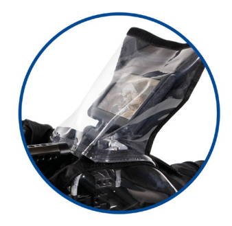
The clear vinyl window allows for easy viewing the top monitor.