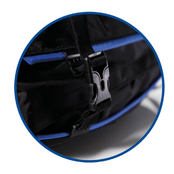
Bring the buckles in the desired position with the blue sliding rail.